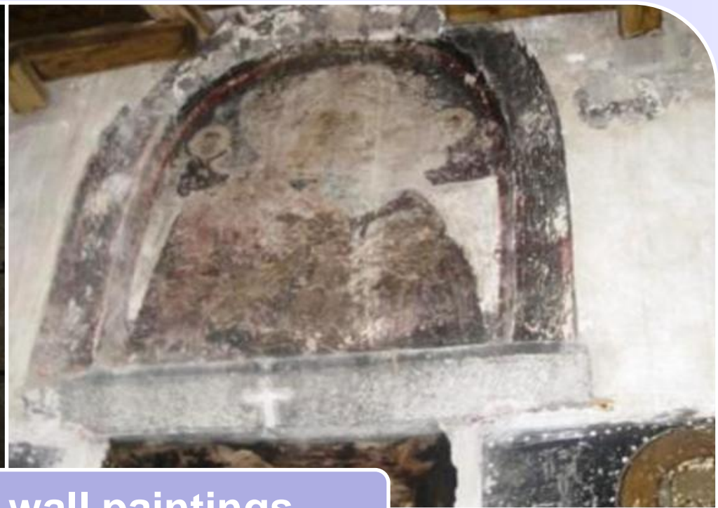
The forecourt wall paintings